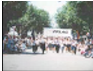
In 1994, these 75 PFLAGers marched in the Redwood City 4th of July Parade. In 2008, let's try to match that, or even better, exceed it!

The rest of the year — we feel good about what we've done.